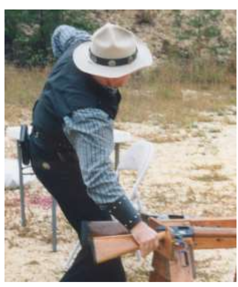
Sourdough Joe transitions from rifle to pistol.

Lastly, don't forget about proper grip, stance, and sighting, also – practice, practice, and practice!