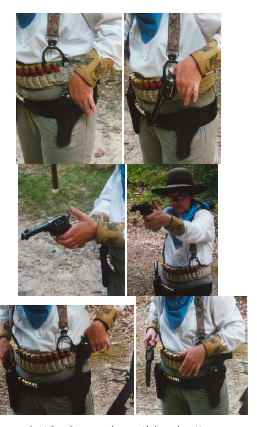
Prairie Dawn Demonstrates the strong side draw and transition