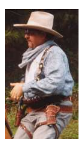
Single Action Jackson drawing for that first shot.